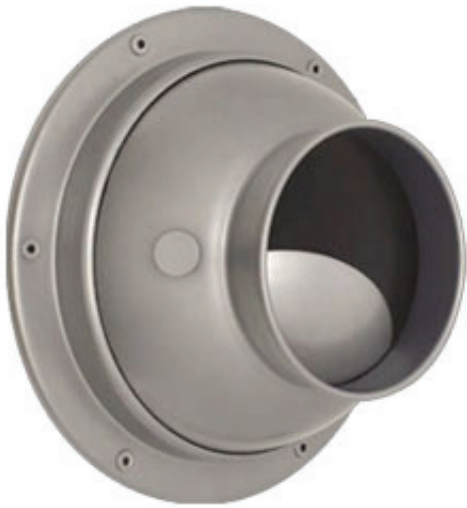
(Model APL-A shown w/ aperture damper)